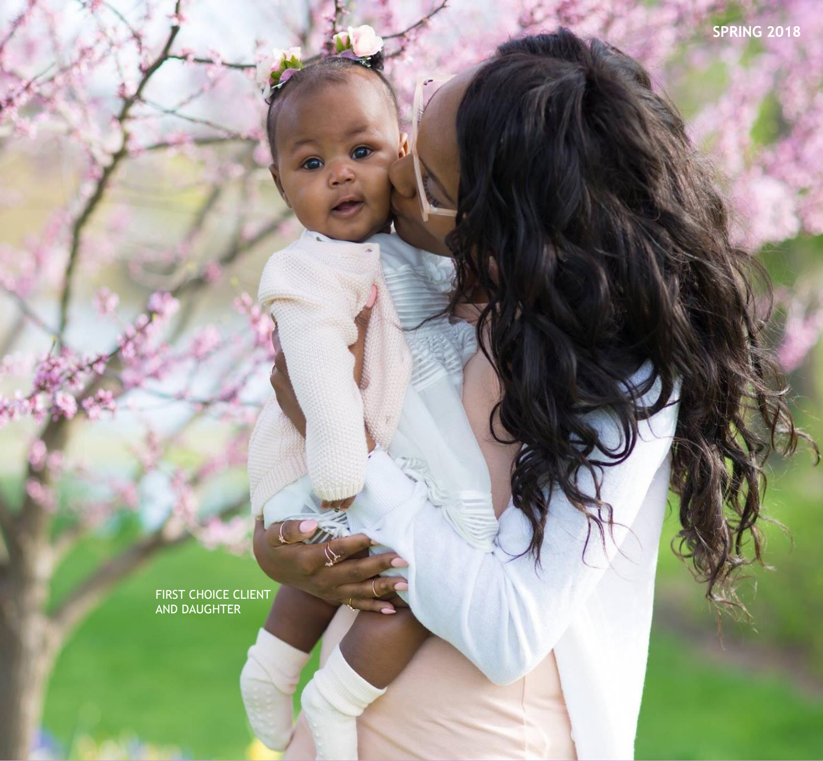
FIRST CHOICE CLIENT AND DAUGHTER